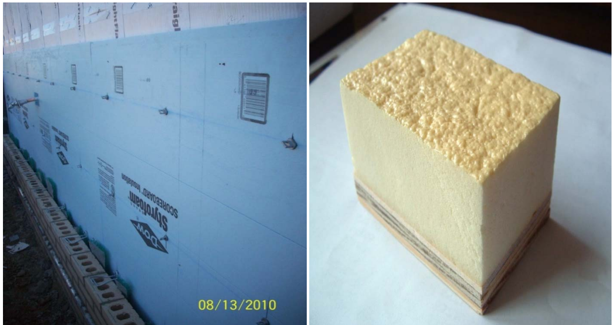
Figure 4: (Left) This installation of the exterior insulation board in this figure is of high quality. Note the boards and joints between them are tight with no large gaps present. Brick ties shown in this installation to are not interfering with the continuity of the insulation and are actually designed to double as fasteners for the insulation boards to the substrate. (Right) An example of a closed cell spray foam insulation material.