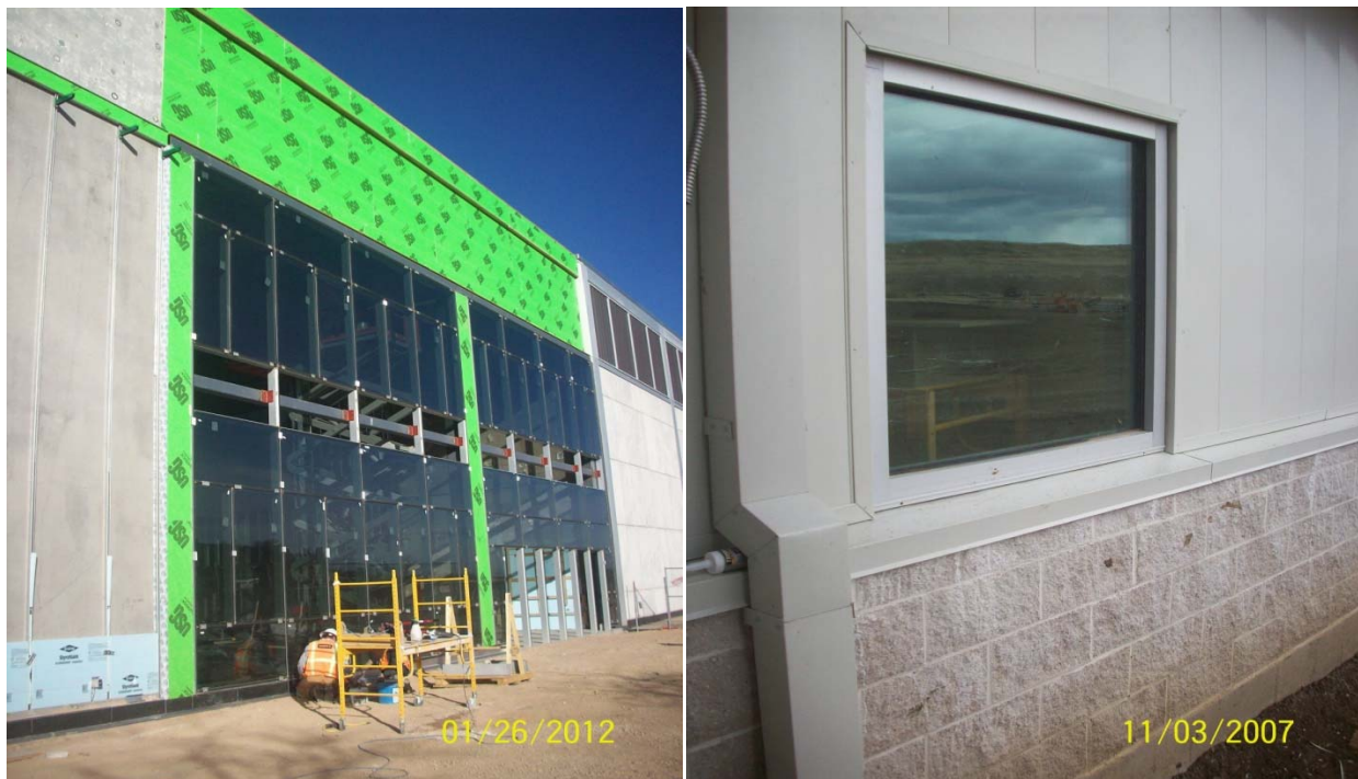
Figure 2: (Left) is an example of a large curtain wall assembly commonly seen in construction applications. (Right) a small fixed aluminum frame window.