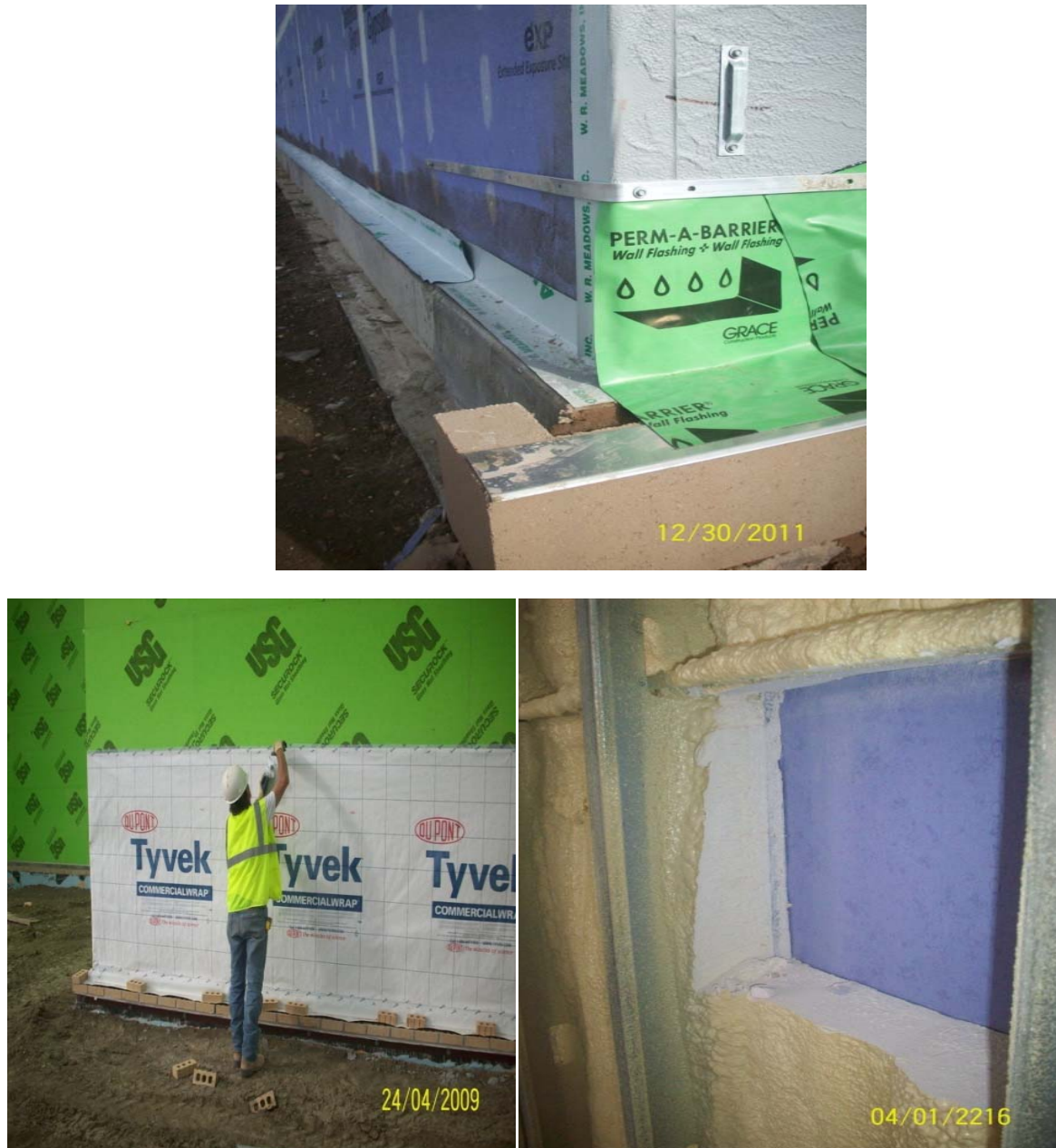
Figure 5: These are examples of the four most common air water and vapor control layer materials. (Top) A fluid applied membrane material and a self adhered membrane functioning as the thru-wall flashing at the mud-sill. (Bottom left) A common mechanically fastened sheet film building wrap product. (Bottom Right) A cut out section of a closed cell spray applied foam applied to the interior cavity of the exterior wall assembly.