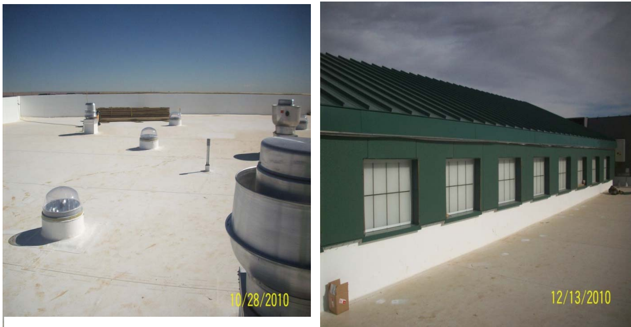
Figure 1. – Left is an example of a fully adhered TPO membrane roof system. On the right, a standing seam metal roofing system.